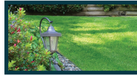
TURF & AGRICULTURE