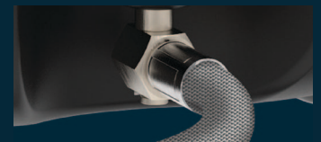
NICKEL-PLATED BRASS SWIVEL HOSE CONNECTION