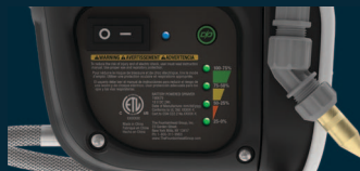
LED BATTERY LIFE INDICATOR