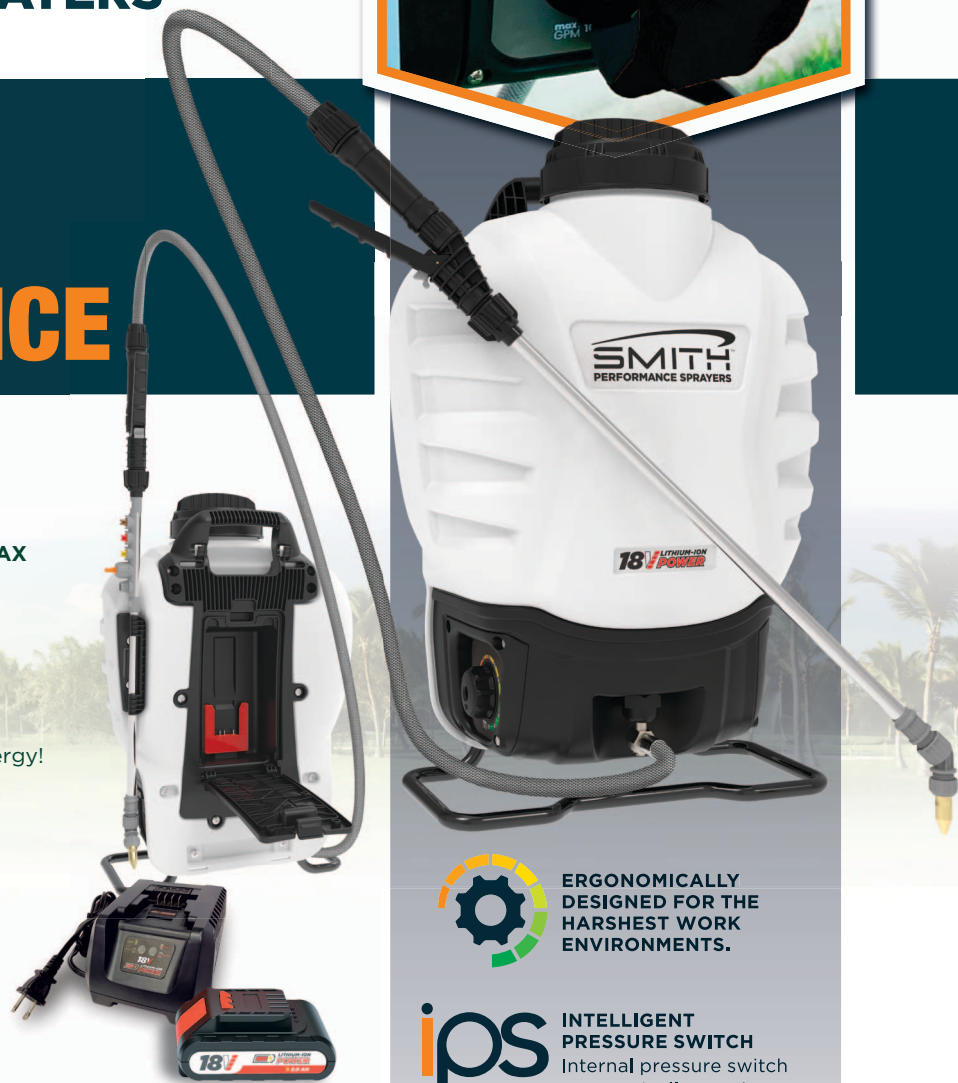
18V / 2.0Ah LITHIUM-ION BATTERY and 110V FAST CHARGER (Included)