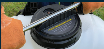
CAP WAND GROOVE FOR TIGHTENING & LOOSENING